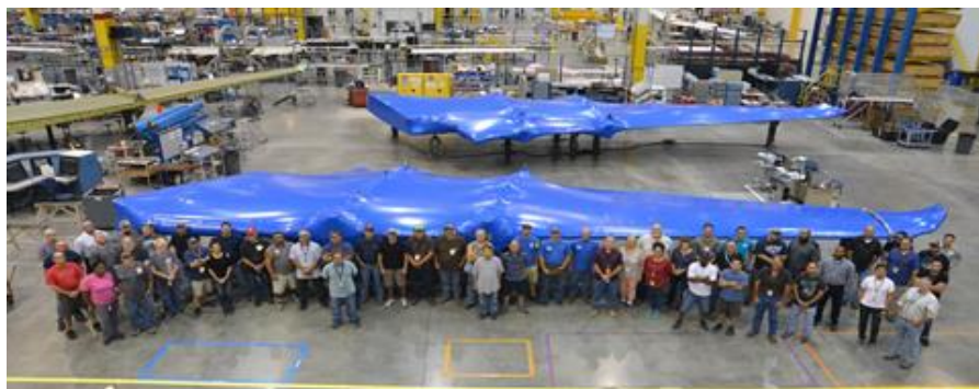
Triumph Aerospace Structures delivered the 750th G550 wingset to Gulfstream in September.