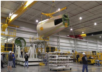
Joining of E2 aft fuselage to CFIII section