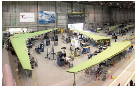
G650 wing production line in Tulsa, Okla.