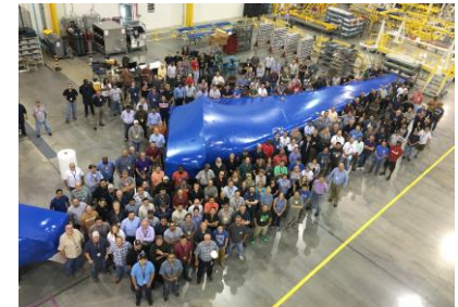
Global 7000 FTV-4 wingset shipment

Triumph managing through our change in business base