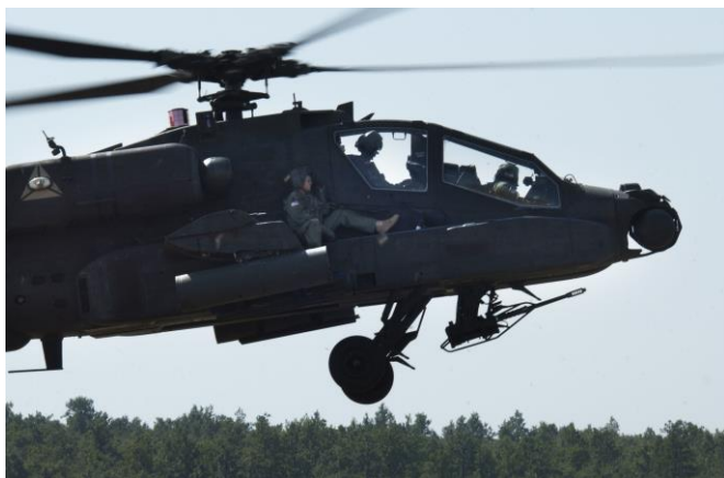
Triumph Integrated Systems selected for AH-64 Apache gun turret actuator upgrade.