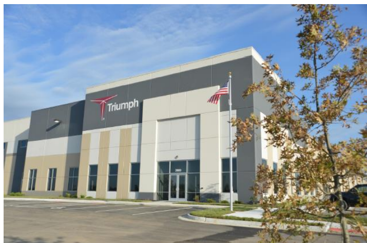
Precision Components' new small and medium parts Center of Excellence in Edgerton, Kansas.