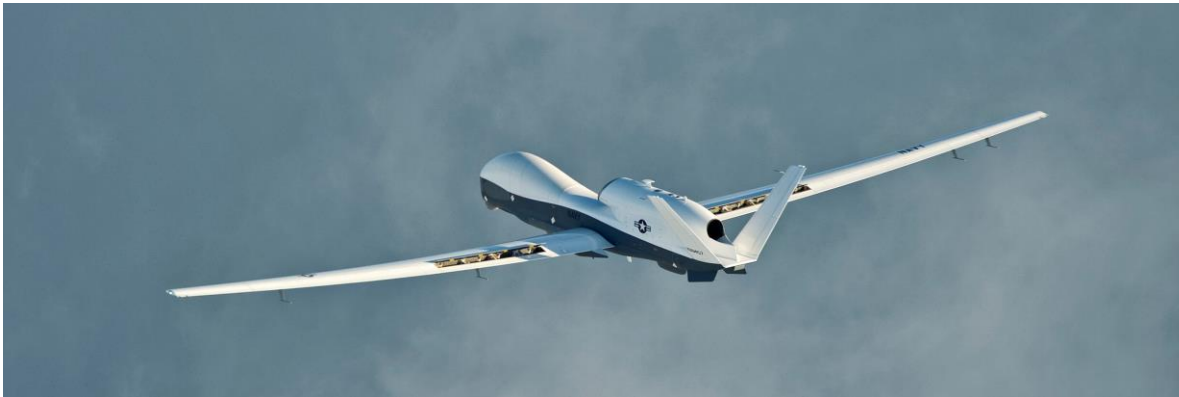
MQ-4C Triton Unmanned Aircraft System.